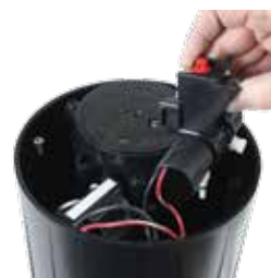
Pilot valve accessible from the top without shutting off water source