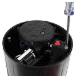
Future-proof your investment. The SMART ACCESS compartment provides room to grow.