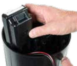
GDC 2-wire module accessible from the top

The opportunities are limitless with the new Toro INFINITY Series golf sprinkler. From immediate convenience, compatibility and labor savings to extra capacity for future technologies, INFINITY keeps you ahead of the game for decades to come.