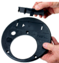
SMART ACCESS Provides top accessibility to all critical components.