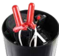
Wire splices protected in the SMART ACCESS compartment and accessible from the top