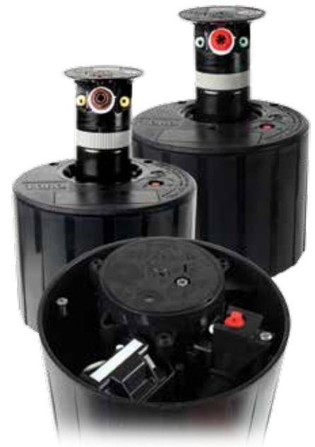
INFINITY. Engineered for Today's Challenges. Designed for Tomorrow's Technologies.