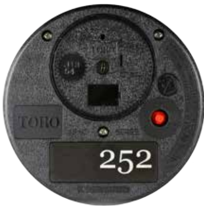
Customizable with golf course logo and/or yardage marker

The benefits to course maintenance and quality are countless, but it's the professional benefits that really make the INFINITY™ Series the smart choice. The latest innovation from TORO, INFINITY let's you truly manage your work crews, budgets and course improvements now and in the future. That not only helps you keep your course looking and playing its best, it makes you look pretty good, too.